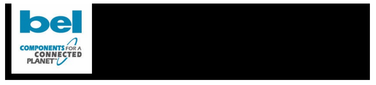
Item 1. Homepage for www.ProxyProcess.com/BelFuse:

This site contains solicitation materials prepared by Bel Fuse Inc. in connection with the 2011 Annual Meeting of Shareholders of Pulse Electronics Corporation scheduled to be held on May 18, 2011.□